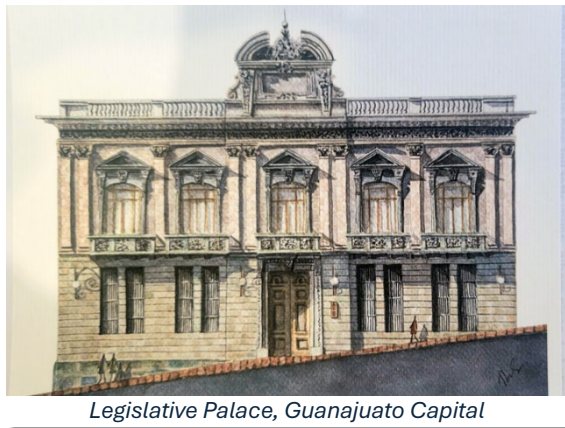
Legislative Palace, Guanajuato Capital